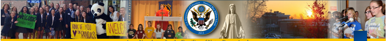
An e-Newsletter for the Families of Notre Dame Academy